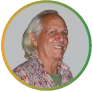
SHRI ROMULUS WHITAKER

kalyanrawat04@gmail.com V.P.O. Nathuwawala, Maiti Sadan, Balawala Road, Nathuwawala, Distt. Dehradun, Uttarakhand-248008