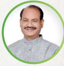
SHRI OM BIRLA HON'BLE SPEAKER, LOK SABHA

It is a matter of great pleasure that Parliamentary Research and Training Institute for Democracies (PRIDE) is bringing out a booklet titled "Sarvashreshtha Pahal" (सर्वश्रेष्ठ पहल). It is a compilation of presentations/addresses delivered by the Padma awardees during the online interactive session organized by PRIDE for Members of Parliament in January, 2021.